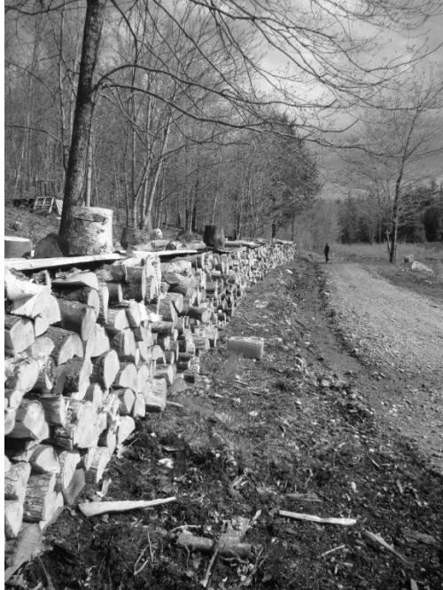
KEEPING THE HOME FIRES BURNING

Together with the Reports of the Pillsbury Lake Water District, Vital Statistics, Etc.