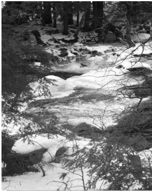
View of the Blackwater River

NOTE: The full Annual Financial Report for the Fiscal Year Ended December 31, 2011 is on file at the Selectmen's Office for review.